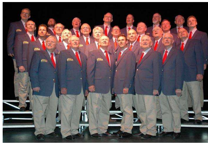
Bozeman Chord Rustlers

“The mission of the Chord Rustlers is to sing a cappella, four-part harmony, in the barbershop style, to support vocal music education of youth, and to provide audiences with wholesome entertainment for all occasions by men who enjoy musical and social camaraderie, desiring to share their love of music within the community, and who aspire to grow in musical excellence and preserve the tradition of four-part harmony singing.”