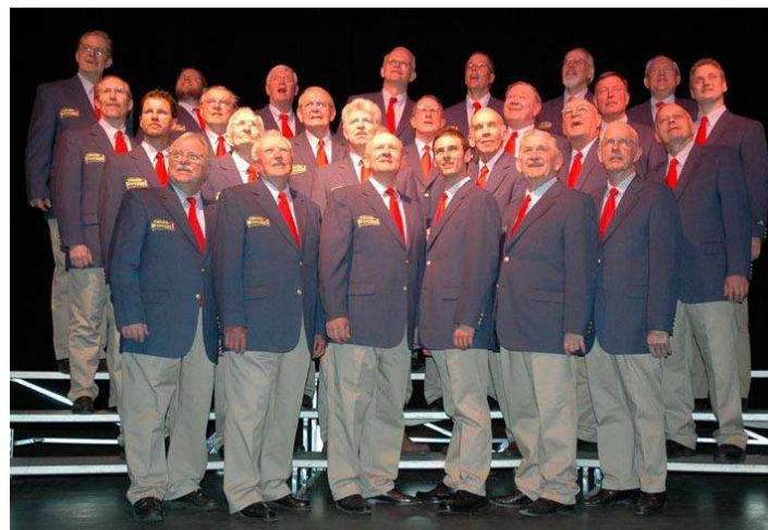
Bozeman Chord Rustlers

"The mission of the Chord Rustlers is to sing a cappella, four-part harmony, in the barbershop style, to support vocal music education of youth, and to provide audiences with wholesome entertainment for all occasions by men who enjoy musical and social camaraderie, desiring to share their love of music within the community, and who aspire to grow in musical excellence and preserve the tradition of four-part harmony singing."