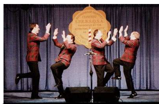
FRED to headline 2009 Annual Show!