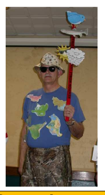
Faces from the Banquet!