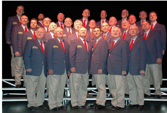
Bozeman Chord Rustlers