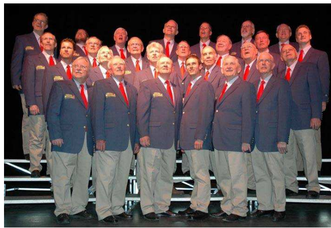
Bozeman Chord Rustlers