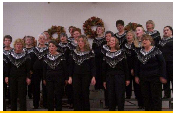
Bridger Mountain Harmony Sweet Adelines