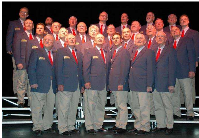
Bozeman Chord Rustlers

The Chord Rustler’s annual show will be April 17–18, 2009 at Grace Bible Church in Bozeman. The show will feature FRED!, a comedy quartet from the Atlanta, Georgia area that captured the Quartet Gold Medal at the 1999 International Convention in Anaheim, California. Check them out at http://www.fredquartet.com .