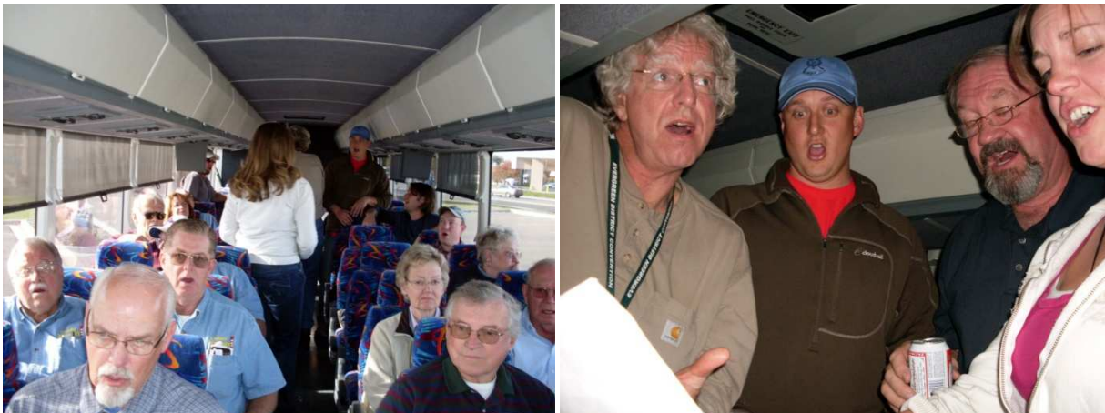
The bus ride!