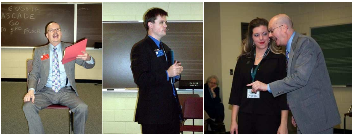
The judges thought we were great!