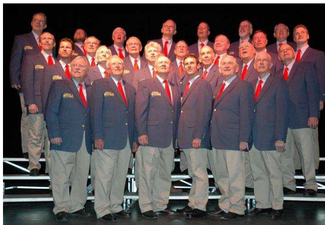
Bozeman Chord Rustlers

“The mission of the Chord Rustlers is to sing a cappella , four-part harmony, in the barbershop style, to support vocal music education of youth, and to provide audiences with wholesome entertainment for all occasions by men who enjoy musical and social camaraderie, desiring to share their love of music within the community, and who aspire to grow in musical excellence and preserve the tradition of four-part harmony singing.”