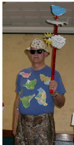
Faces from the Banquet!