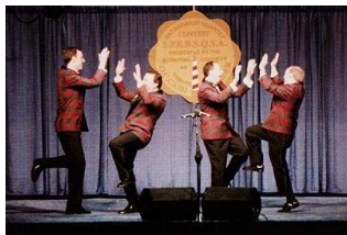
FRED to headline 2009 Annual Show!