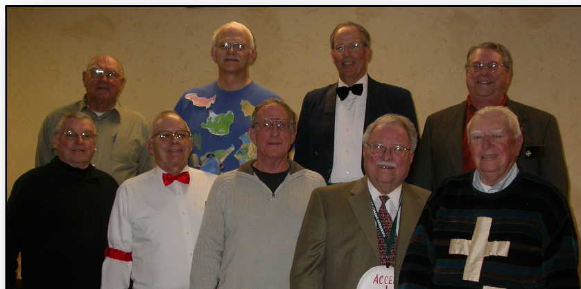
Chord Rustler Officers for 2009