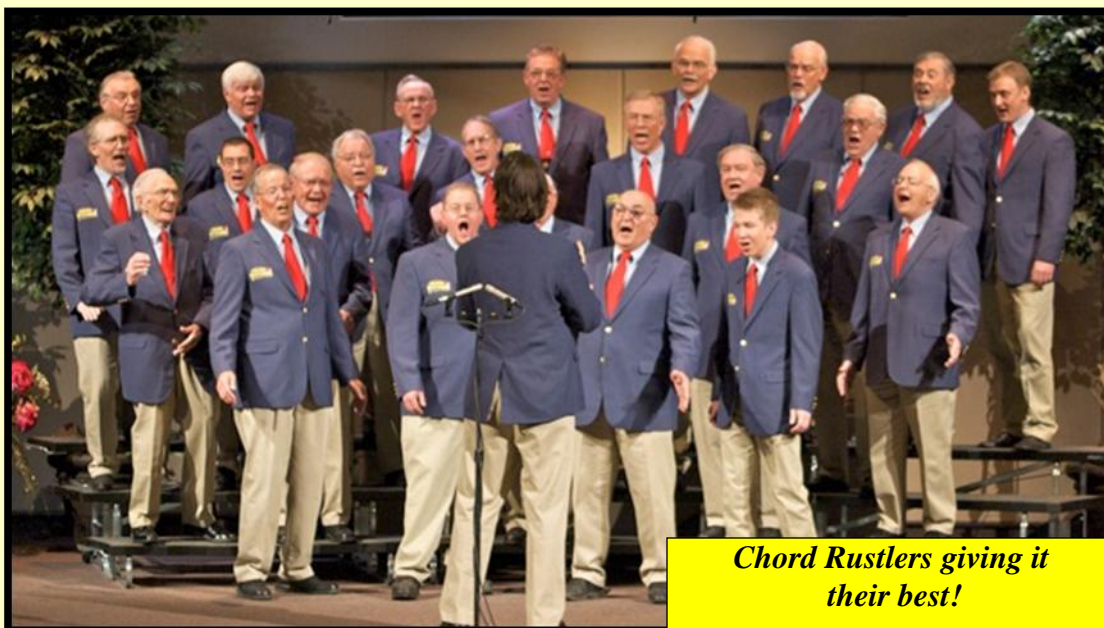
Chord Rustlers giving it their best!