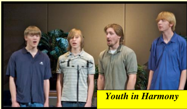
Youth in Harmony