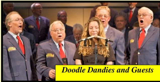
Doodle Dandies and Guests