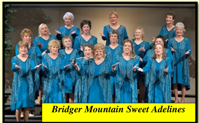
Bridger Mountain Sweet Adelines