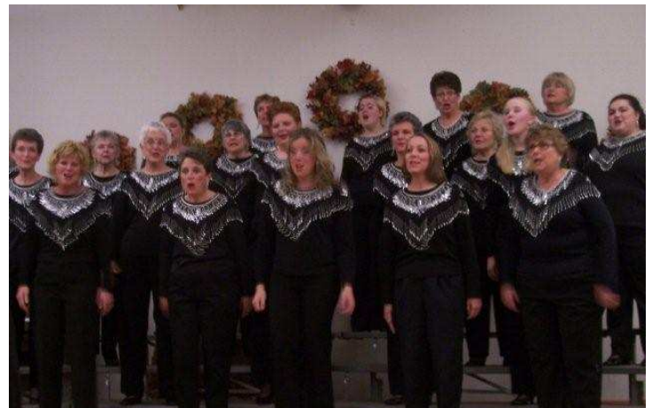
Bridger Mountain Harmony Sweet Adelines