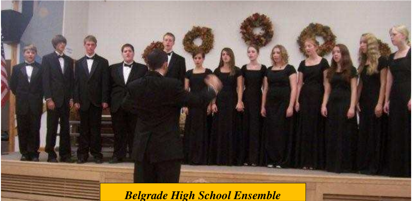
Belgrade High School Ensemble