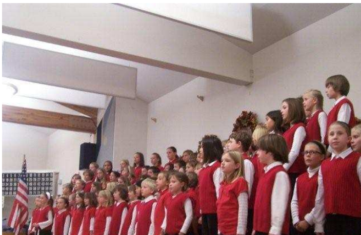
Hawthorne Children's Choir