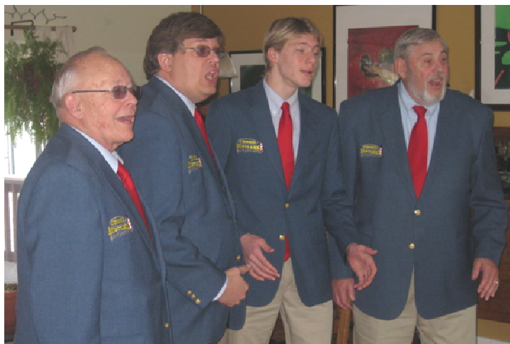
The "New Guys" Offer up A Singing Valentine