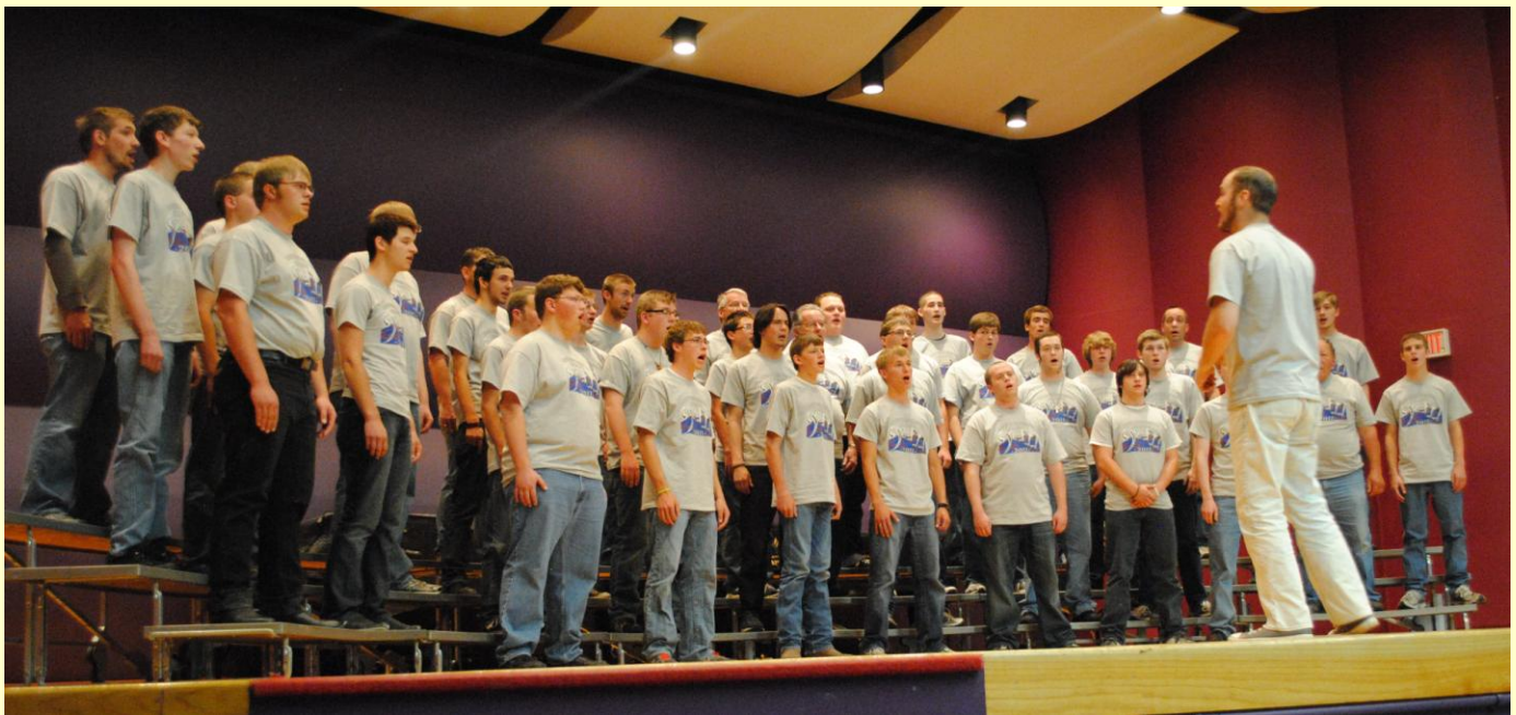
Harmony Rendezvous