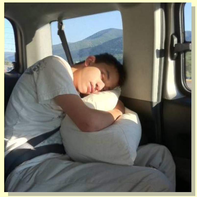
Boy, that was a tough rehearsal!

This rehearsal is important for everyone as it is our last scheduled rehearsal to get us in shape for the District contest in Spokane September 30–October 1.